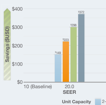
Annual Energy Cost Savings for Cooling 10-SEER Baseline*